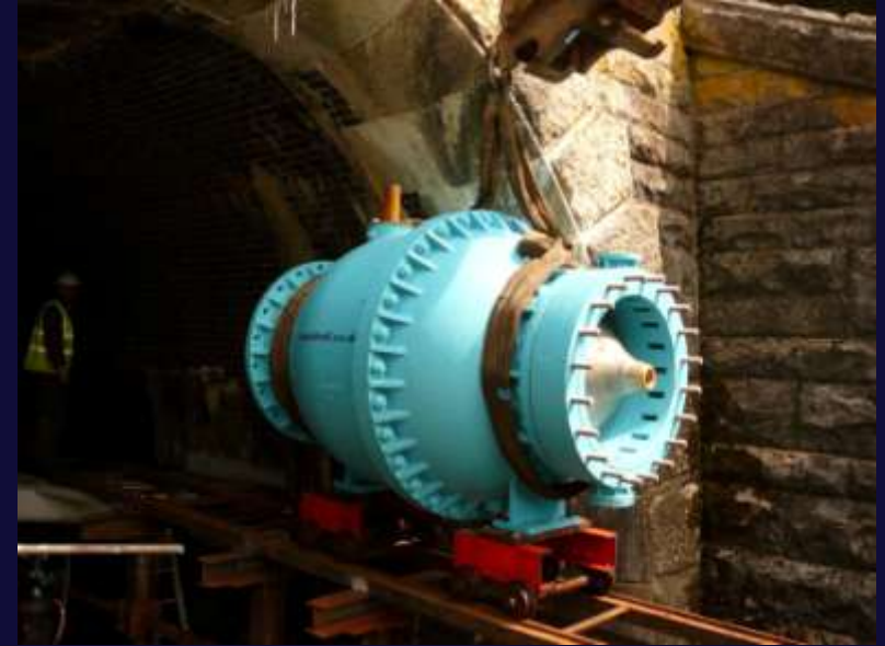
United Utilities Llwyn-On Reservoir 2007 & 2008